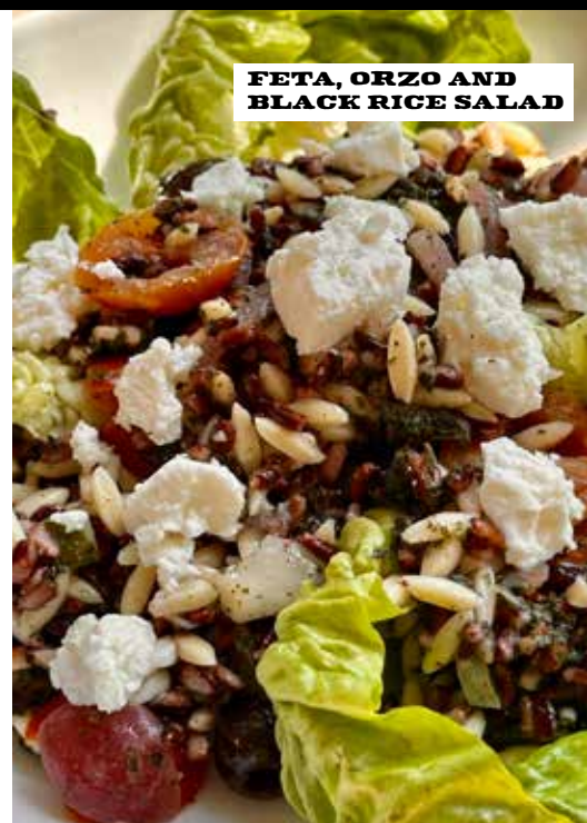
FETA, ORZO AND BLACK RICE SALAD