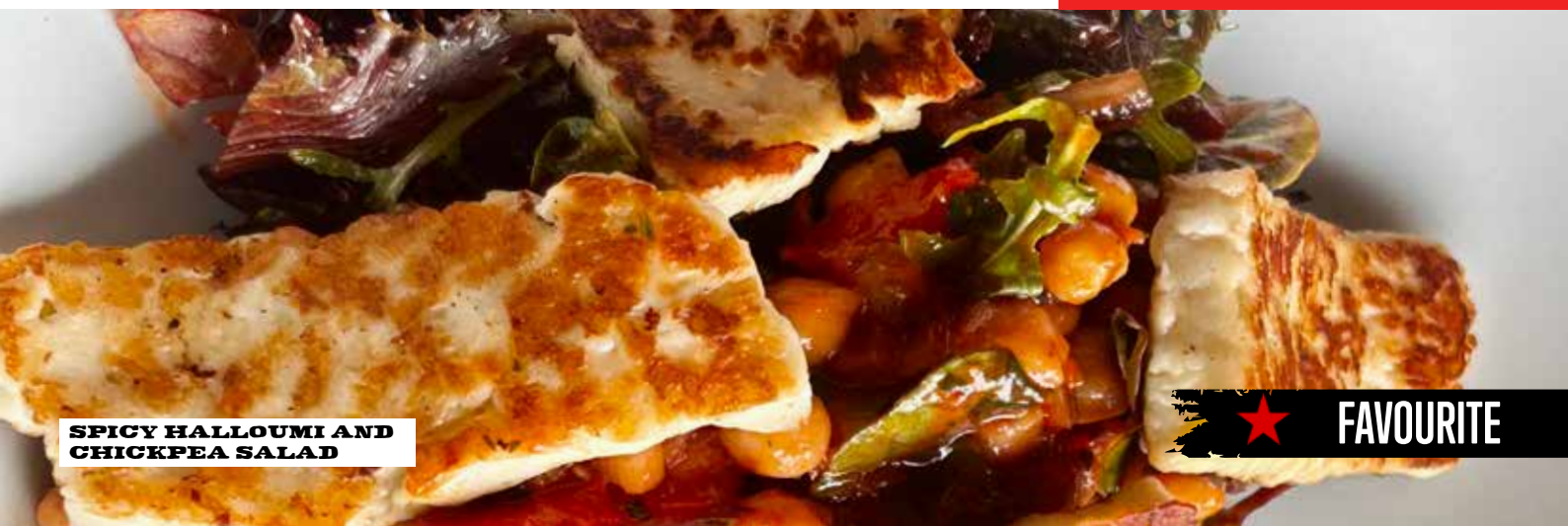
SPICY HALLOUMI AND CHICKPEA SALAD